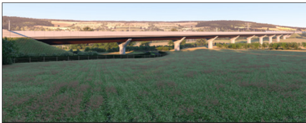
Wendover Dean Viaduct - artist's impression