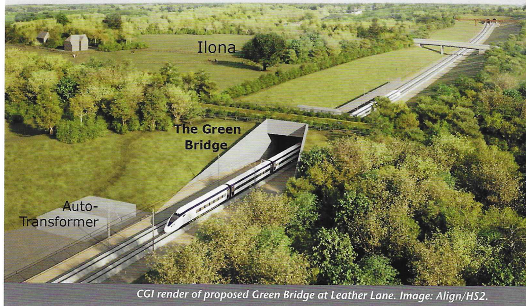
CGI render of proposed Green Bridge at Leather Lane.

original plans would have been unlawful in light of the bat activity data. Due to LLCG's work, HS2 and Align accepted the need for a fundamental redesign of the Leather Lane overbridge crossing HS2's track.