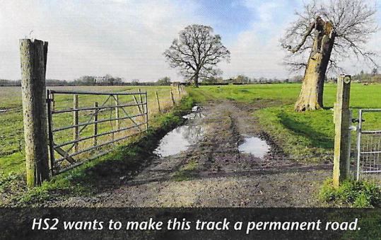
HS2 wants to make this track a permanent road.