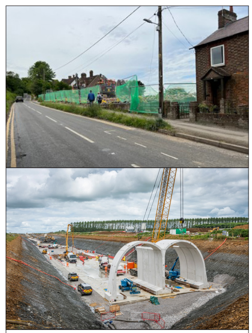
above - Ellesborough Road demolition and EKFB's first green tunnel at Chipping Warden.

has been the demolition of the cottages in Ellesborough Road. Following delays due to bats and nesting birds there is now a gap in the row of houses where the cutting for the "Green Tunnel" will be excavated. This will be about 18 metres deep (the height of four double decker buses...) to allow the pre-cast concrete tunnel to be installed before it is covered up and the ground level restored. Access to Coombe Hill and Butlers Cross