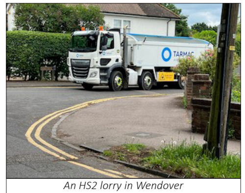
An HS2 lorry in Wendover

There was a recent spate of HS2 related HGV lorries carrying tarmac going through Wendover trying to find the works compound beside the bypass. This should not be happening, as the formal route explicitly avoids the village centre. You can report issues like this (or make any other complaints) to the HS2 Helpdesk which is available 24 hours a day on 08081 434 434.