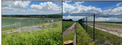
Map of new PRoW route (top) Photos of Ellesborough Road (south) end, Wellwick (north) end, and Midpoint of path

The circuitous path follows the edge of the land allocated for use by HS2, and will be part of the eventual design once the Green Tunnel has been built.