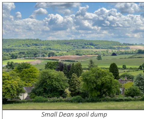
Small Dean spoil dump

While the Environment Agency is understood to be withholding approval for any works that will affect the Aquifer in the Green Tunnel section, considerable excavation has been undertaken in the Small Dean section in preparation for the Viaduct. There is now a massive spoil dump at Small Dean Lane, which is estimated to grow to 150,000 tons of material before being moved north to form the embankment beside the Bypass and cover the Green Tunnel.