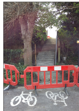
New steps to the station car park, with cycleway markings, Coombe Avenue. No sign by mid-April of the cycle ramp proposed in the plans.

If you have ideas and suggestions that would mitigate the community impact, then get in touch at enquiries@whs2.org and we'll assist however we can. Remember that the HS2 Helpdesk is available 24 hours a day to handle any complaints on 08081 434 434.