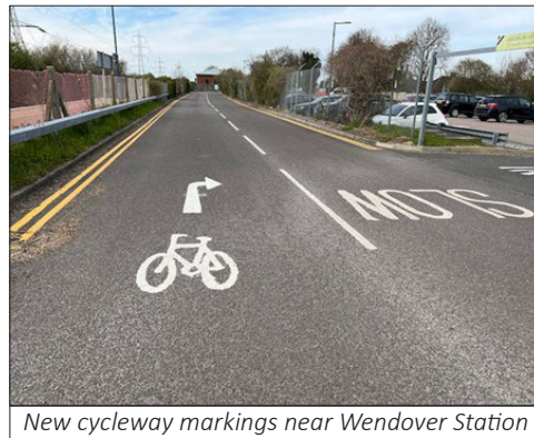
New cycleway markings near Wendover Station

Bucks Council are administering the HS2 Road Safety Fund which is supporting local improvement initiatives. During April the cycleway on Aylesbury Road has been extended to reach the station, with the definition of cycle tracks on various local roads (see photos). Applications are being accepted now for suggested projects for the second "tranche" of funding, until the end of May. Further details can be found on our whs2.org website.