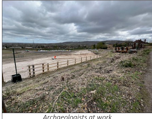
Archaeologists at work

During April the track of the temporary diversion behind the cottages in Ellesborough Road became visible with the removal of the topsoil to allow archaeologists to continue the work begun two years ago.