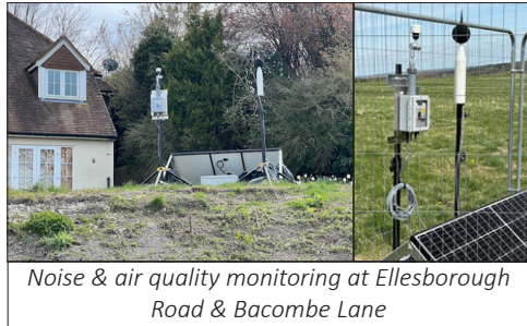
Noise & air quality monitoring at Ellesborough Road & Bacombe Lane

We're pleased to see that Noise, Vibration and Air Quality monitoring has also been installed prior to the start of demolition of the cottages and excavation of the cutting. HS2's contractors are required to abide by the "Code of Construction Practice" which is available on their website, along with the monthly reports of the Environmental Monitoring measurements.