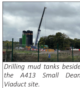
Drilling mud tanks beside the A413 Small Dean Viaduct site.

Now that piling has been completed for the Wendover Dean Viaduct, foundations preparations are also visible for the works on the Small Dean Viaduct, with installation of Bentonite tanks beside the A413. These provide "drilling mud" to manage the groundwater in the 50 metre deep holes needed for the piles to support the viaduct piers.