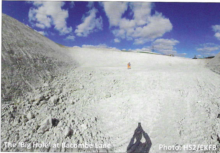
The 'Big Hole' at Bacombe Lane